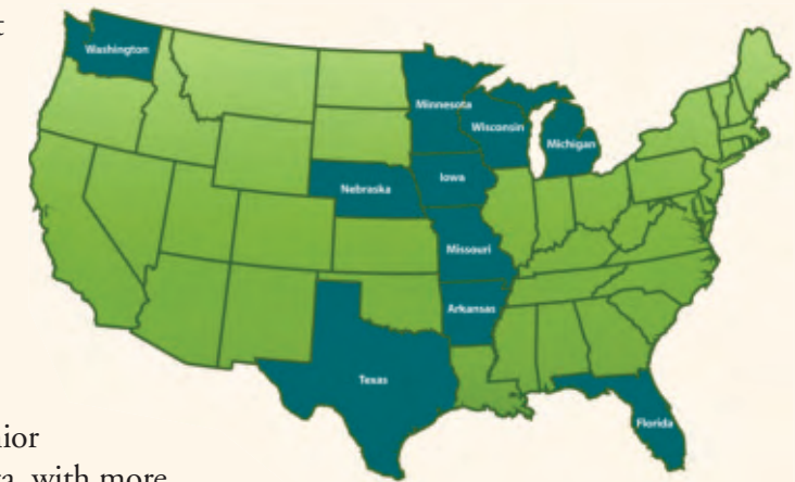
The 10 states with senior cooperatives with Minnesota holding the most with 74.

In 1978, Minnesota built its very first senior housing cooperative at 7500 York in Edina, which became the model that made our state the leader in senior housing cooperatives. According to the Senior Cooperative Foundation, there are currently 74 senior cooperatives in Minnesota, with more being planned. In nine other states, there are a total of 20 senior housing cooperatives.