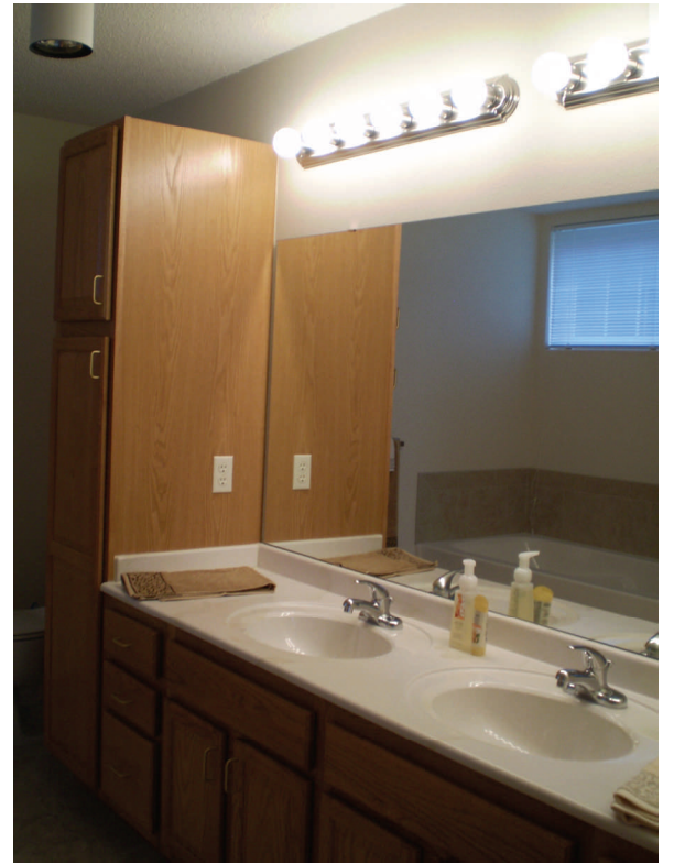
SPACIOUS BATHROOM, WITH SEPARATE SHOWER/BATH