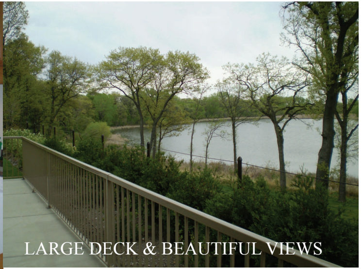
LARGE DECK & BEAUTIFUL VIEWS