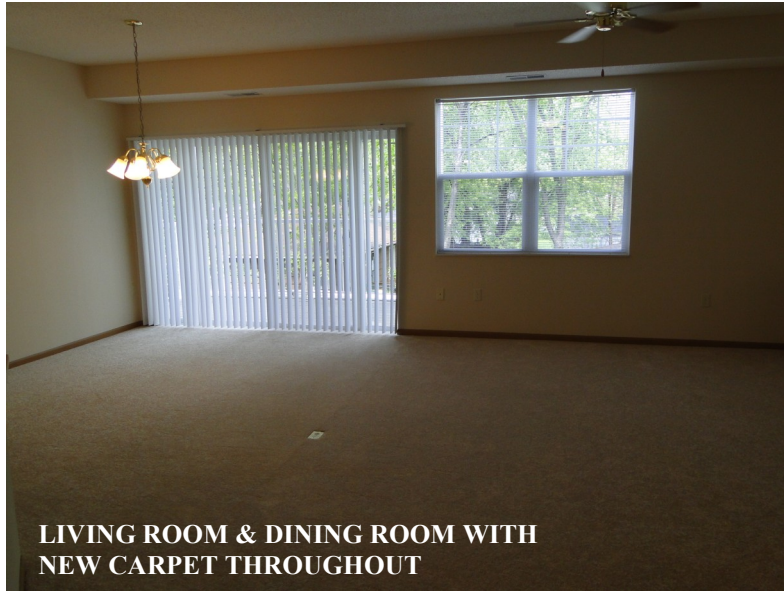
LIVING ROOM & DINING ROOM WITH NEW CARPET THROUGHOUT