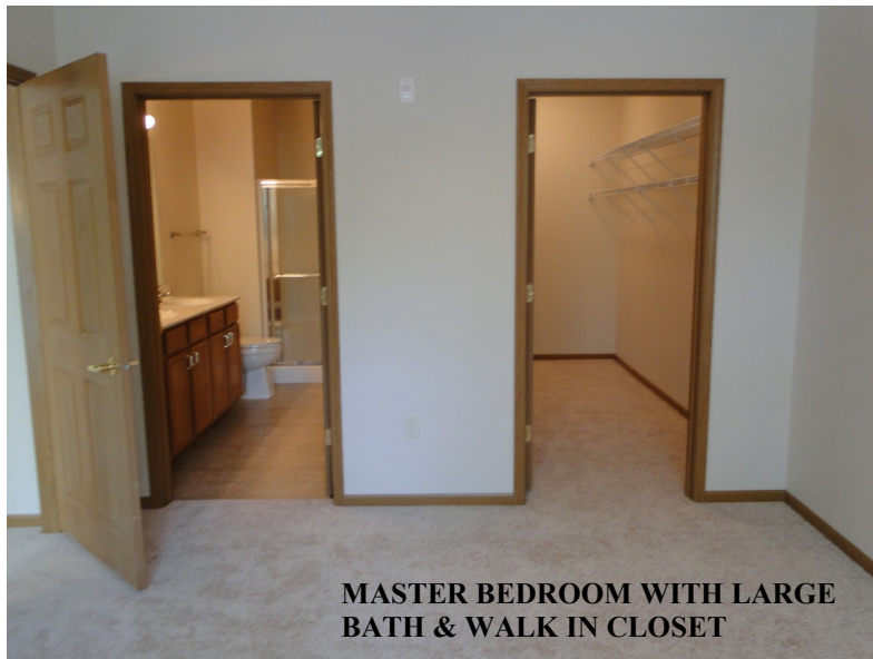
MASTER BEDROOM WITH LARGE BATH & WALK IN CLOSET