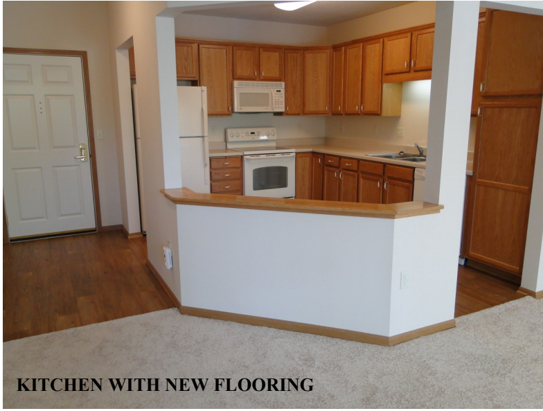
KITCHEN WITH NEW FLOORING